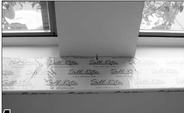
4 Set the sill on the shims and line up the center line you marked on the sill with the line you marked on the wall in step 2.

Make sure you read and understand these instructions before beginning your installation.