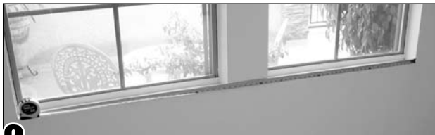
2 Measure and mark on the wall the center of the combined window openings.