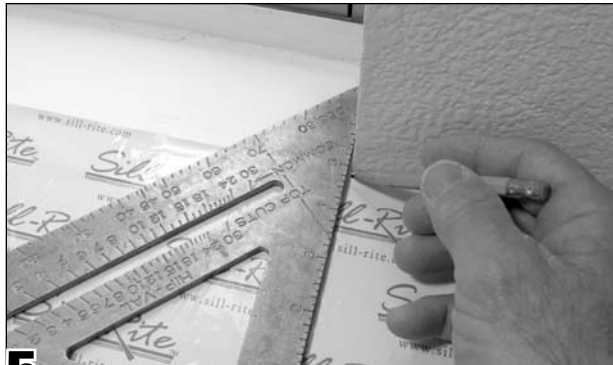
5 With a square, mark each edge of the window openings on the Sill-Rite sill and extend the mark.