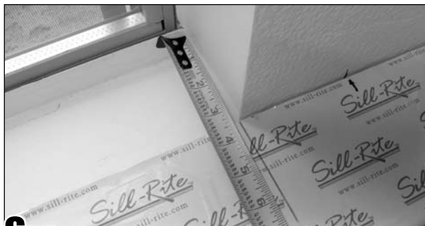
6 Measure the depth of the window openings and transfer markings to the sill.