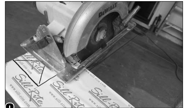
8 Cut on the extended lines. Do not cut past the intersections.