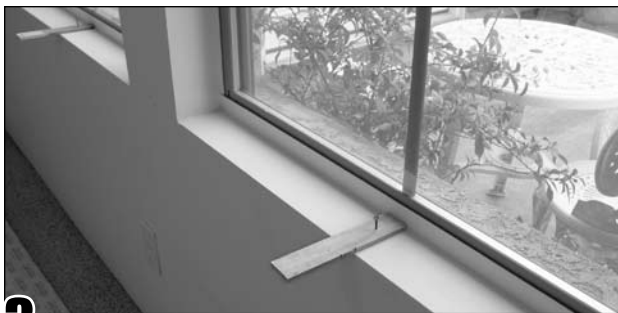
3 Temporarily, install shims at the center of each window opening so that they extend at least three inches beyond the window sill.