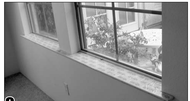
9 Remove the shims and set the Sill-Rite sill in the openings. Check for fit and adjust as necessary. Finish installing by following steps 8-11 of the Basic Installation Instructions .